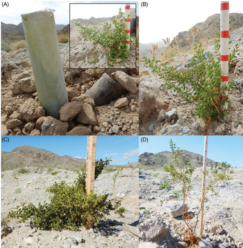
Figure 1. Examples of natural Larrea tridentata recruits and treatments applied to them in an assisted natural regeneration experiment in the Mojave Desert, California, USA. (A) Factorial combination of protection via a tree shelter and irrigation via slow-release gel in the brown tube applied to the Larrea individual shown in the inset photo. (B,D) The same individual 21 cm tall in April 2017 (B) that grew to be 58 cm tall in March 2019 (D) that had received a shelter (briefly removed in the photo for taking plant measurements) and had 20% brown foliage concentrated on the lower part of the plant. (C) 22-cm tall Larrea in March 2019 that had received no treatment and had been 12 cm tall in April 2017.

U.K.). Shelters were buried into the soil and anchored upright using rocks and staples affixing the shelter to the ground.